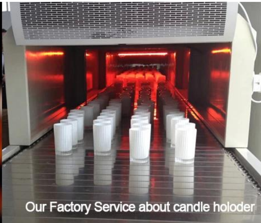
Our Factory Service about candle holder