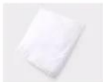
A. White paper