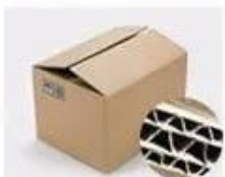
H. Seven layer Corrugated paper master carton