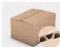
F. Three layer Corrugated paper master carton