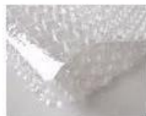
C. Bubble paper