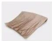
B. Corrugated paper