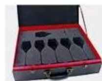
N. Gift Box