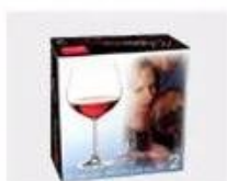
K. Color Box