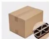
G. Five layer Corrugated paper master carton