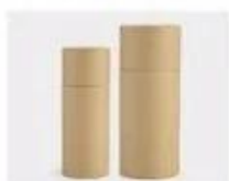
L. Paper Sleeve