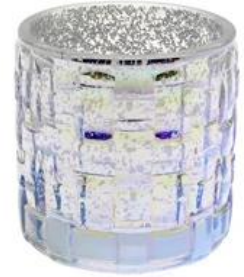
Glass Candle Holder with Hollow Plated and Colorful