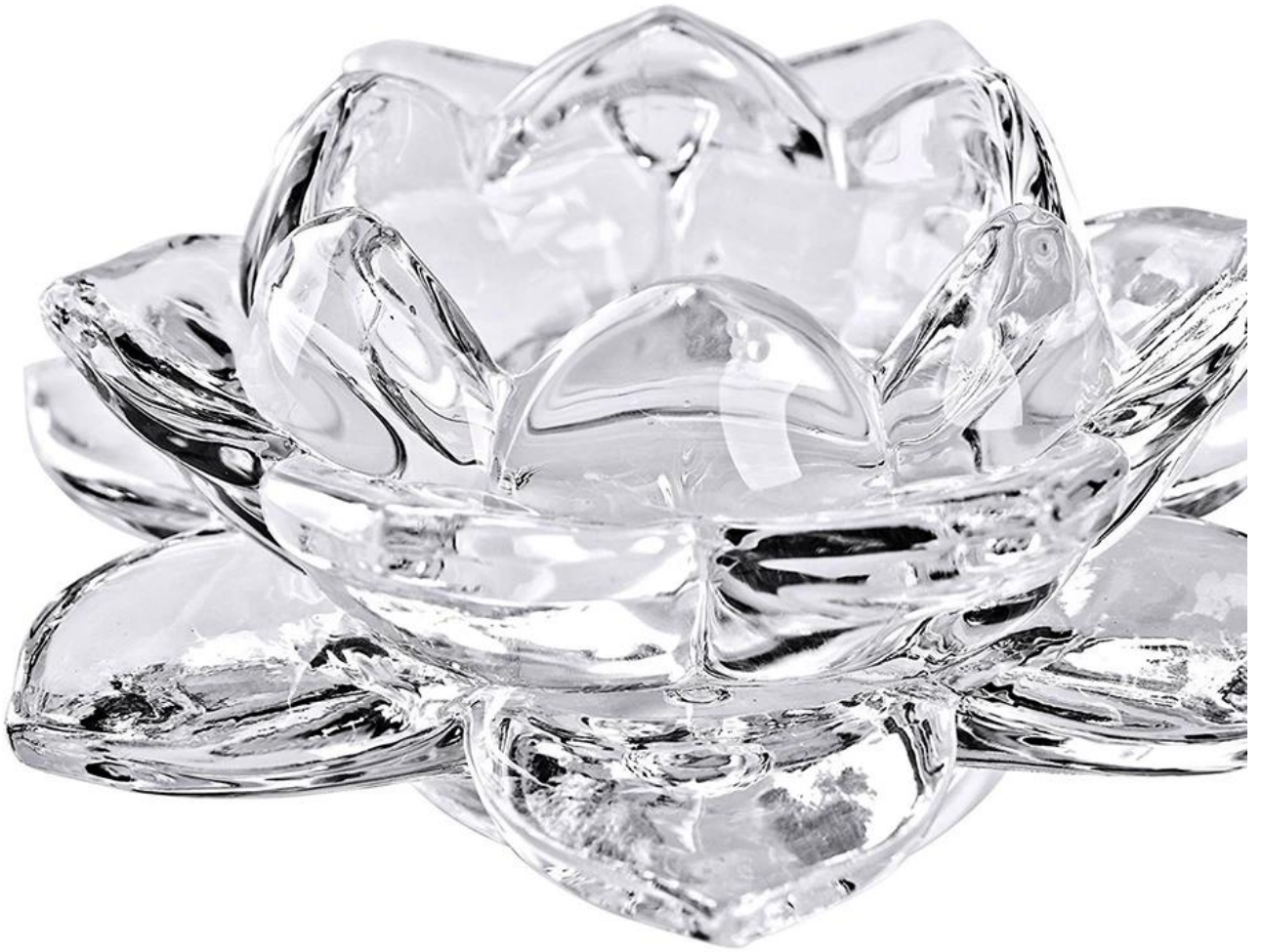
CD014 OEM Accept Lead-free Glass Wholesale Crystal Candle Holder Factory In China