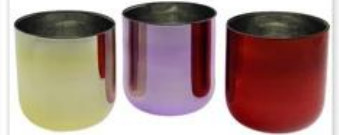
Plated and Painting Glass Candle Holder