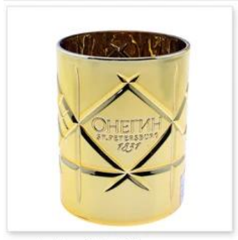
Golden Plated Glass Candle Holder