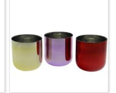
Plated and Painting Glass Candle Holder