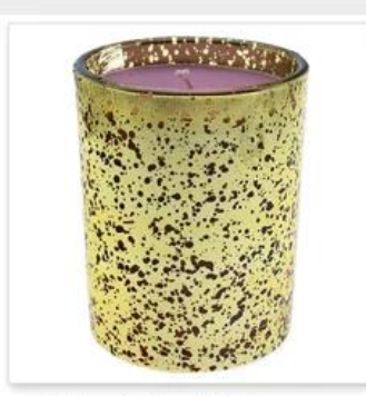
Hollow Golden Plated Glass Candle Holder