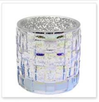
Glass Candle Holder with Hollow Plated and Colorful