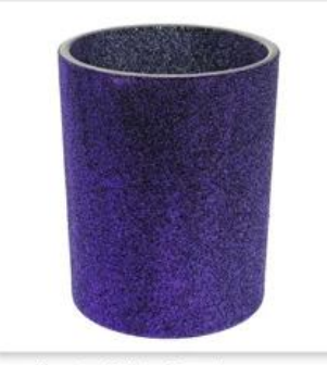
Purple Glitter Powder Glass Candle Holder