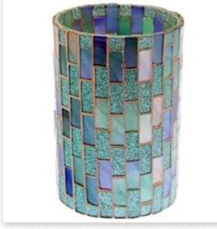
Mosaic Glass Candle Holder