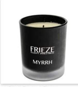
Black Frosted Glass Candle Holder