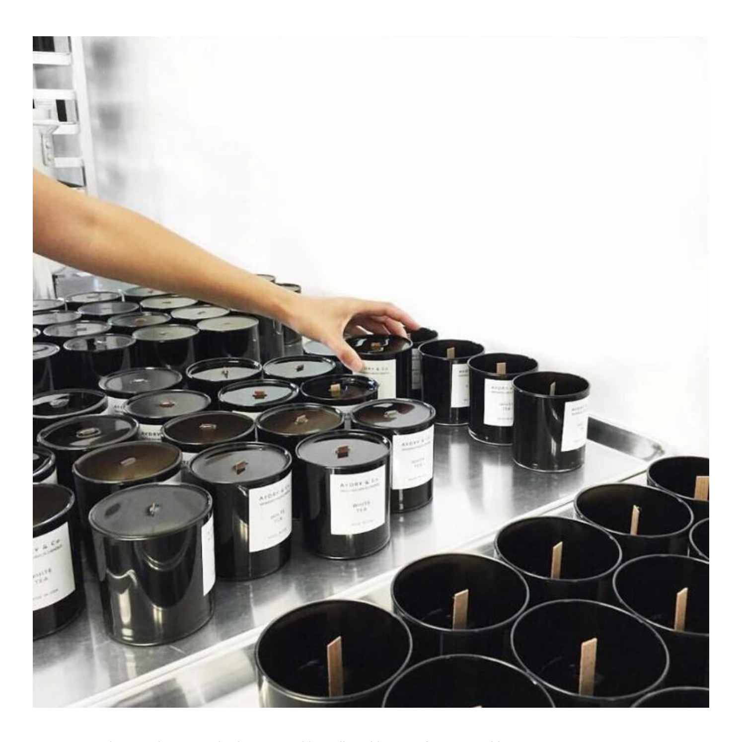
CD012 Top Sale Low Price Customization Rose Gold Candle Holder Manufacturer In China