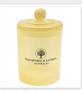
Glass Candle Jar