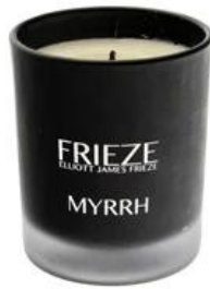
Black Frosted Glass Candle Holder