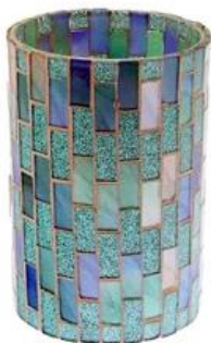
Mosaic Glass Candle Holder