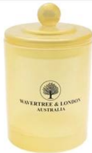
Glass Candle Jar