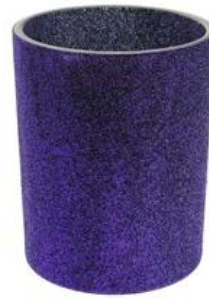
Purple Glitter Powder Glass Candle Holder