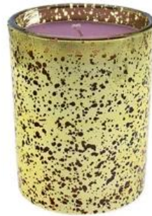
Hollow Golden Plated Glass Candle Holder