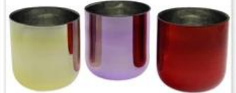
Plated and Painting Glass Candle Holder