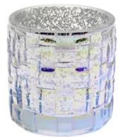
Glass Candle Holder with Hollow Plated and Colorful