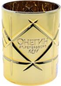
Golden Plated Glass Candle Holder