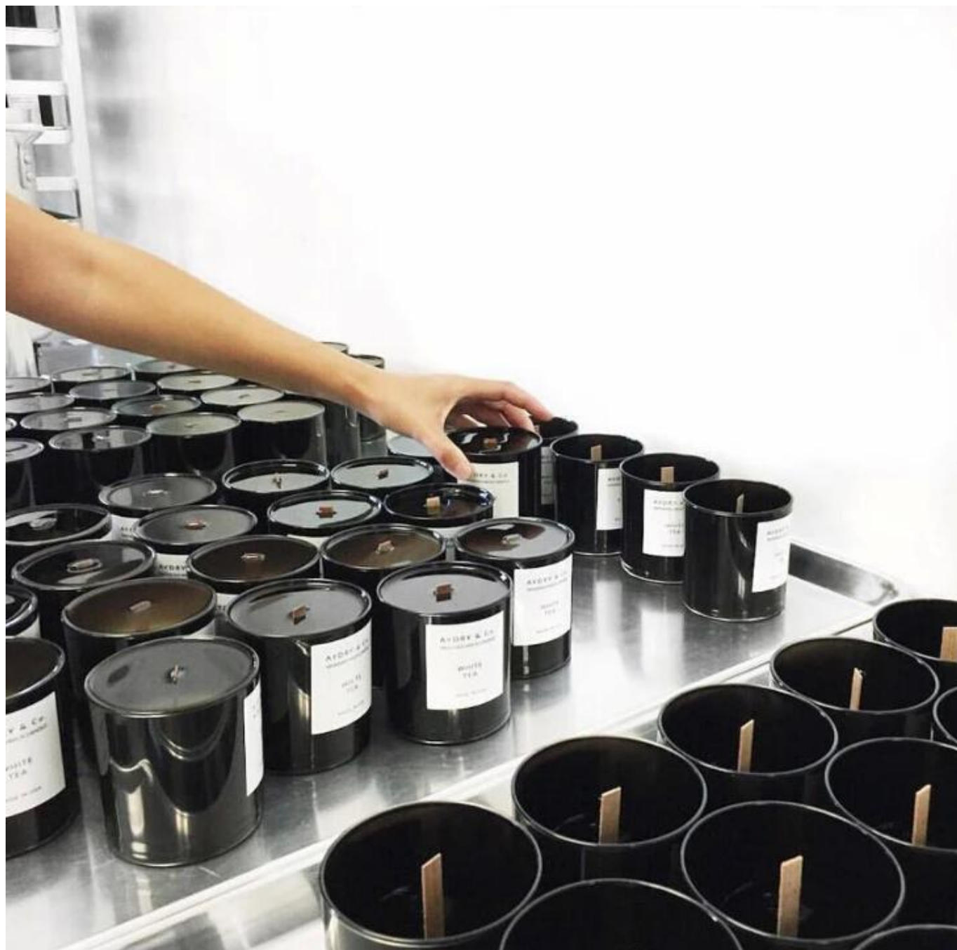
CD007 New Fashion Custom Logo Glass Gold Candle Holder Supplier From China