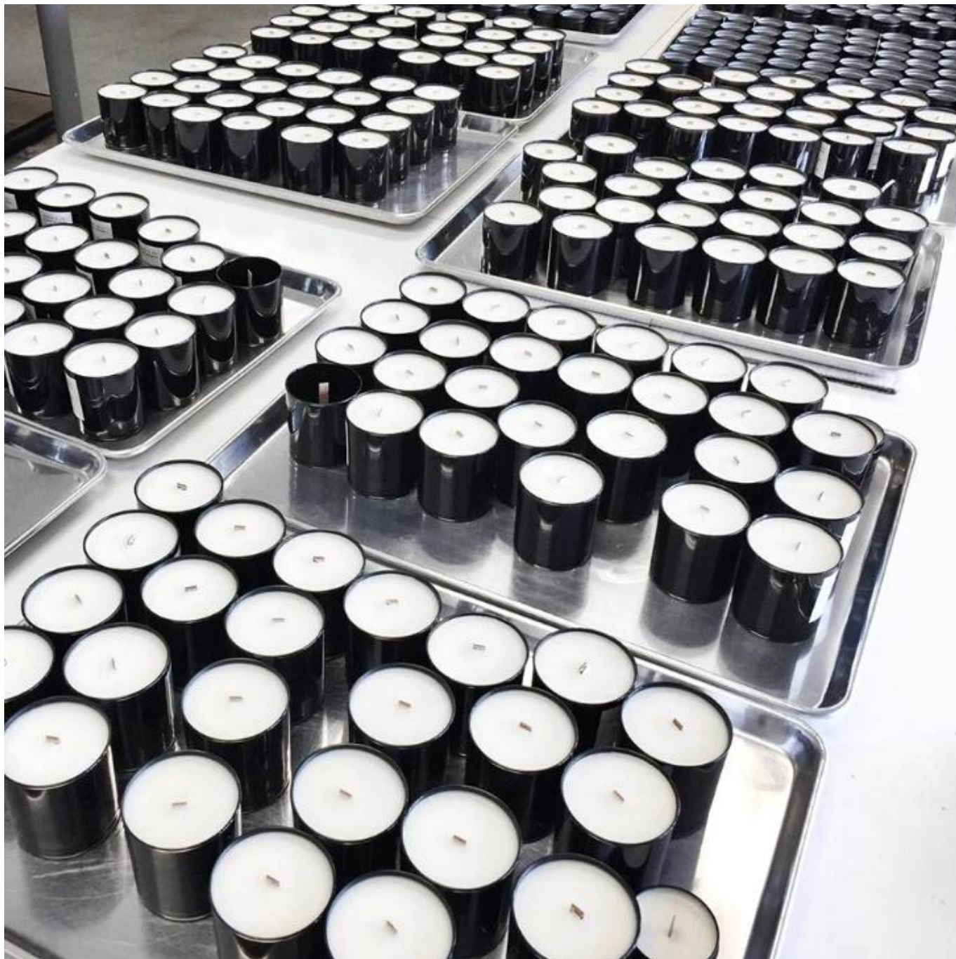
CD006 Newest FDA Certificate Soda-lime Glass Decorating Candle Holder Wholesale In China