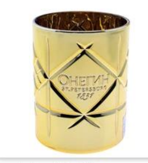
Golden Plated Glass Candle Holder