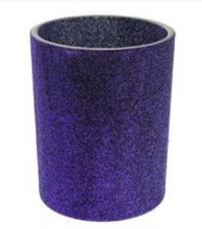
Purple Glitter Powder Glass Candle Holder