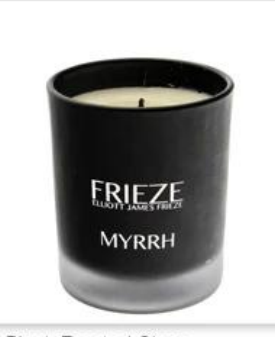
Black Frosted Glass Candle Holder