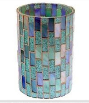
Mosaic Glass Candle Holder