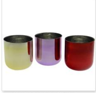
Plated and Painting Glass Candle Holder