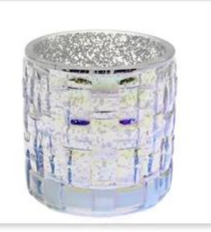
Glass Candle Holder with Hollow Plated and Colorful