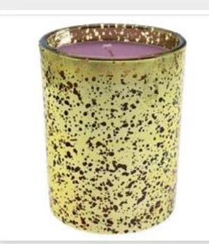
Hollow Golden Plated Glass Candle Holder