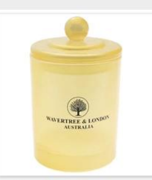
Glass Candle Jar