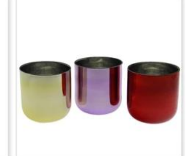
Plated and Painting Glass Candle Holder