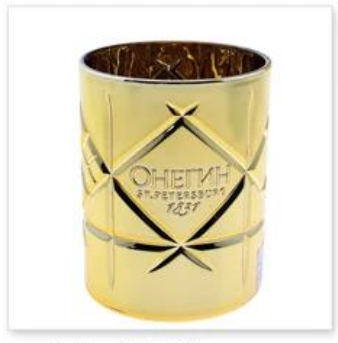
Golden Plated Glass Candle Holder