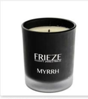
Black Frosted Glass Candle Holder