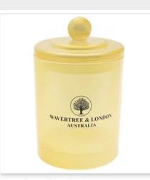
Glass Candle Jar