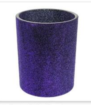
Purple Glitter Powder Glass Candle Holder