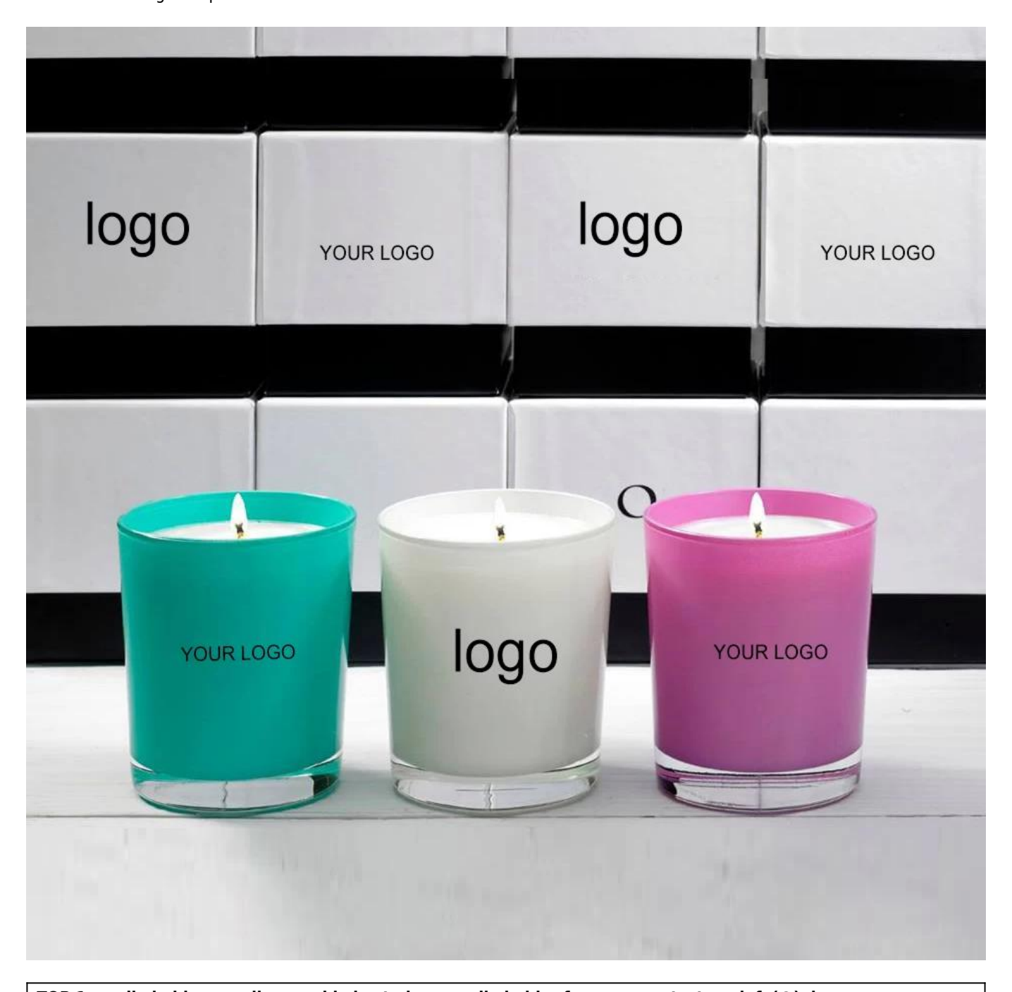
TOP 1 candle holder supplier provide best glass candle holder for your, contact us: info(@)glassware-suppliers.com

CD001 Hot Selling Cheap Price Customized Clear candle holder Manufacturer from China