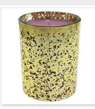
Hollow Golden Plated Glass Candle Holder