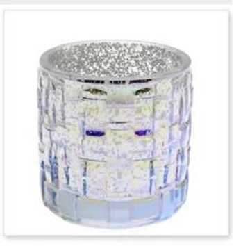
Glass Candle Holder with Hollow Plated and Colorful