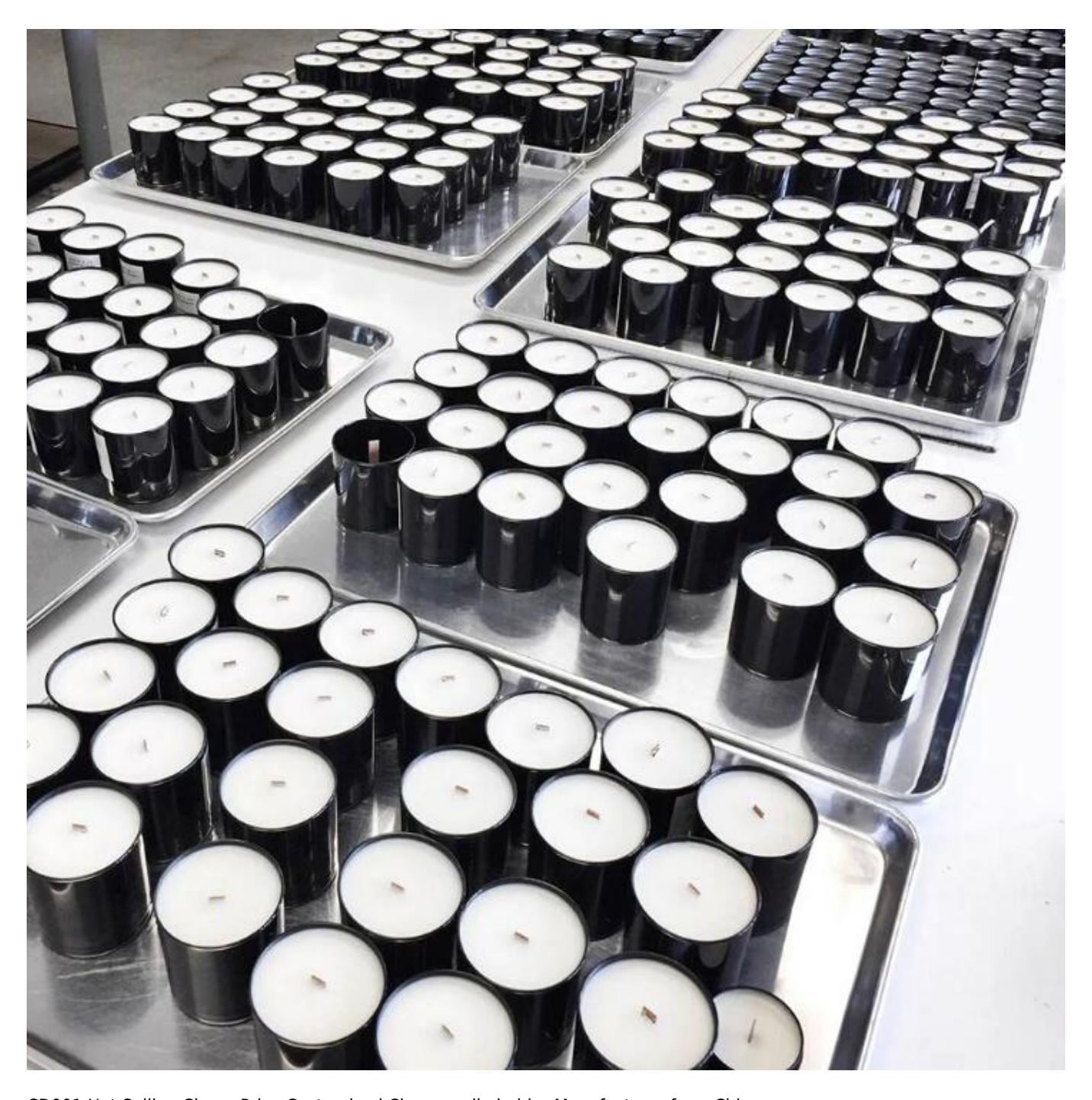
CD001 Hot Selling Cheap Price Customized Clear candle holder Manufacturer from China