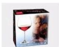
K. Color Box