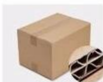
G. Five layer Corrugated paper master carton