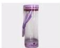
M. Pvc Box