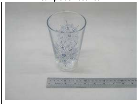
Sample as Received

SGS authenticate the photo on original report only