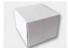
J. White Box