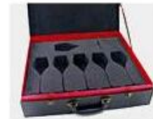
N. Gift Box