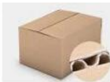
F. Three layer Corrugated paper master carton