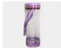
M. Pvc Box