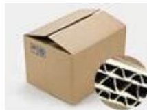
H. Seven layer Corrugated paper master carton