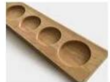
R. Wooden Pallet