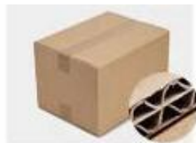
G. Five layer Corrugated paper master carton