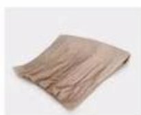
B. Corrugated paper