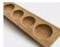
R. Wooden Pallet

Q: Can you print our logo on the amber glass bottle ?