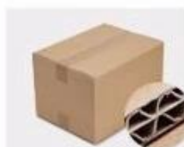
G. Five layer Corrugated paper master carton