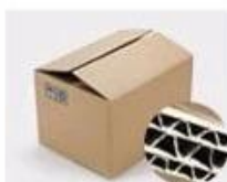
H. Seven layer Corrugated paper master carton