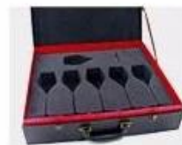
N. Gift Box