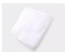
A. White paper