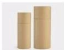
L. Paper Sleeve