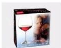
K. Color Box