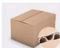
F. Three layer Corrugated paper master carton