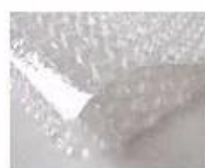
C. Bubble paper