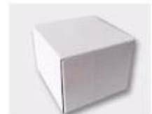
J. White Box