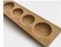
R. Wooden Pallet

Q: Can you print our logo on the decorating candle jars?