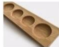
R. Wooden Pallet

Q: Can you print our logo on the decorating candle jars?