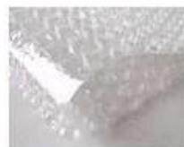
C. Bubble paper