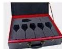
N. Gift Box