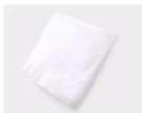
A. White paper