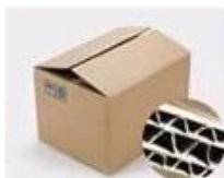
H. Seven layer Corrugated paper master carton