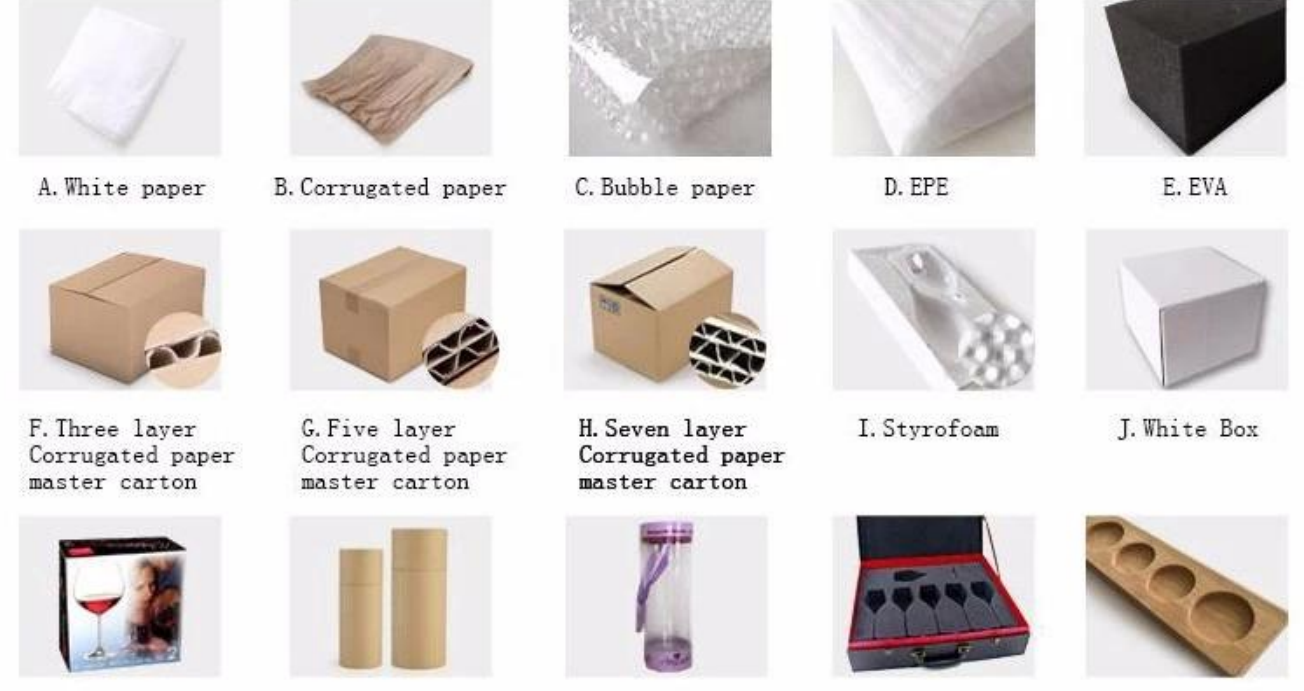
K. Color Box