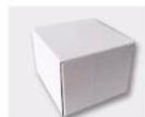
J. White Box