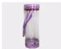
M. Pvc Box