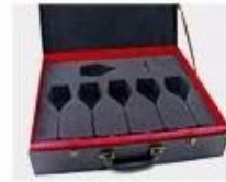
N. Gift Box