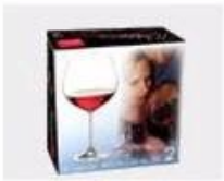
K. Color Box