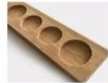
R. Wooden Pallet