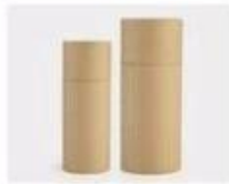
L. Paper Sleeve