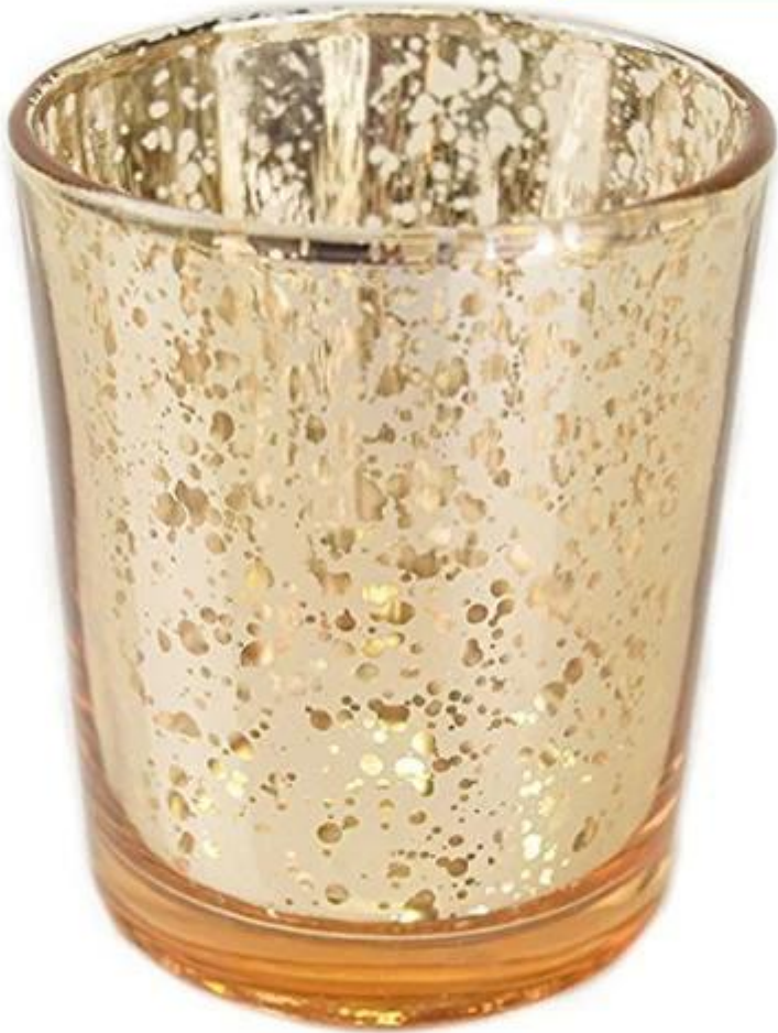
CD008 New Promotion 100% Full Test Free Sample Candle Holder Glass Supplier In China