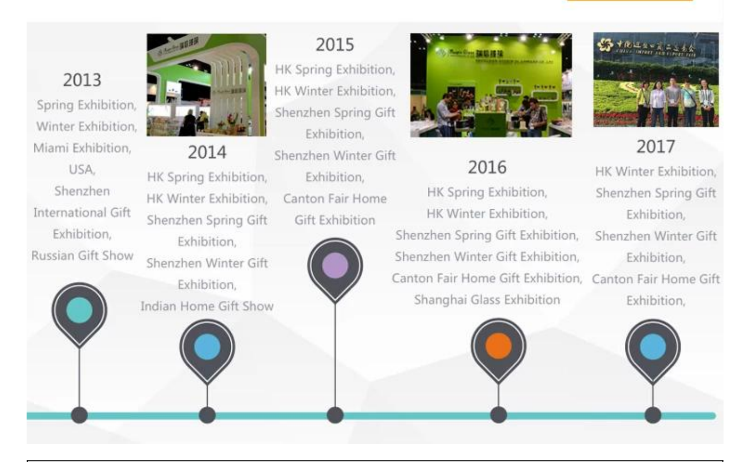
TOP 1 candle holder supplier provide best glass candle holder for your, contact us: info(@)glassware-suppliers.com