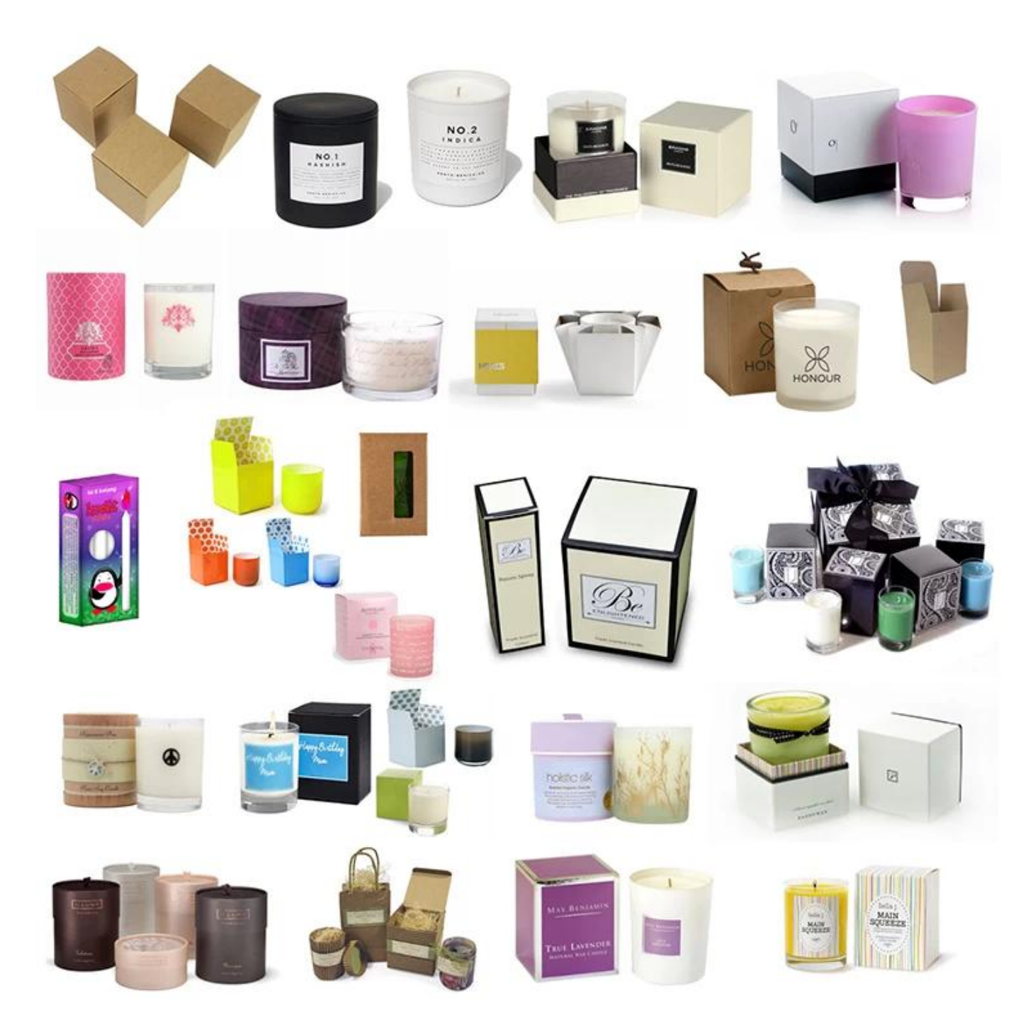
CD007 New Fashion Custom Logo Glass Gold Candle Holder Supplier From China