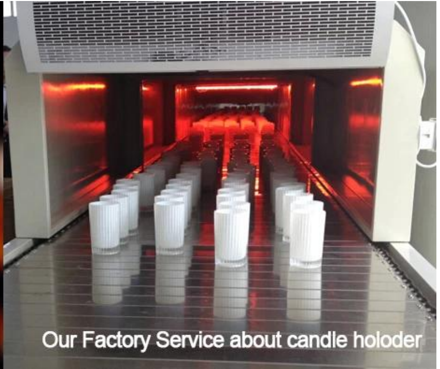
Our Factory Service about candle holder

02 Decorating Candle Holder Wedding,Rose Gold Candle Holder,Gold Votive Candle Holder Wholesale