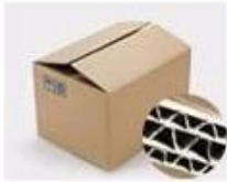
H. Seven layer Corrugated paper master carton