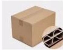
G. Five layer Corrugated paper master carton