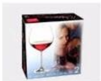
K. Color Box