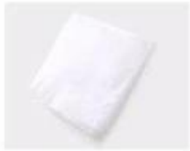
A. White paper