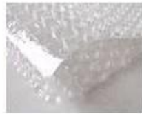
C. Bubble paper