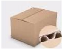
F. Three layer Corrugated paper master carton