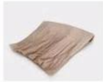
B. Corrugated paper