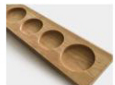
R. Wooden Pallet