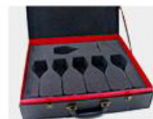
N. Gift Box