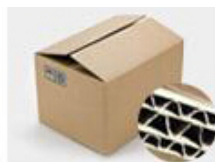
H. Seven layer Corrugated paper master carton