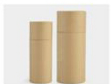
L. Paper Sleeve