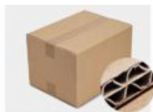
G. Five layer Corrugated paper master carton