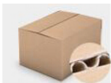
F. Three layer Corrugated paper master carton