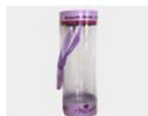
M. Pvc Box