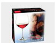
K. Color Box