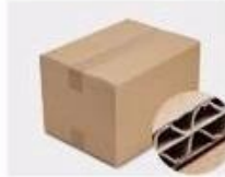
G. Five layer Corrugated paper master carton