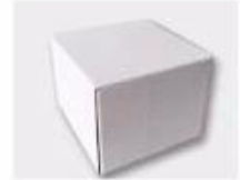
J. White Box