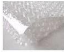
C. Bubble paper