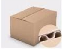
F. Three layer Corrugated paper master carton