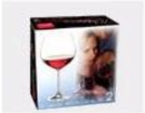
K. Color Box