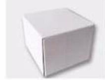
J. White Box