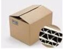
H. Seven layer Corrugated paper master carton